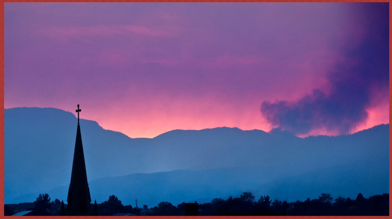
CLOCKWISE FROM TOP LEFT....

"MORNING RUN IN THE WOODS" BY BRUCE DU FRESNE "SLURRY DROP" BY BILL HADL