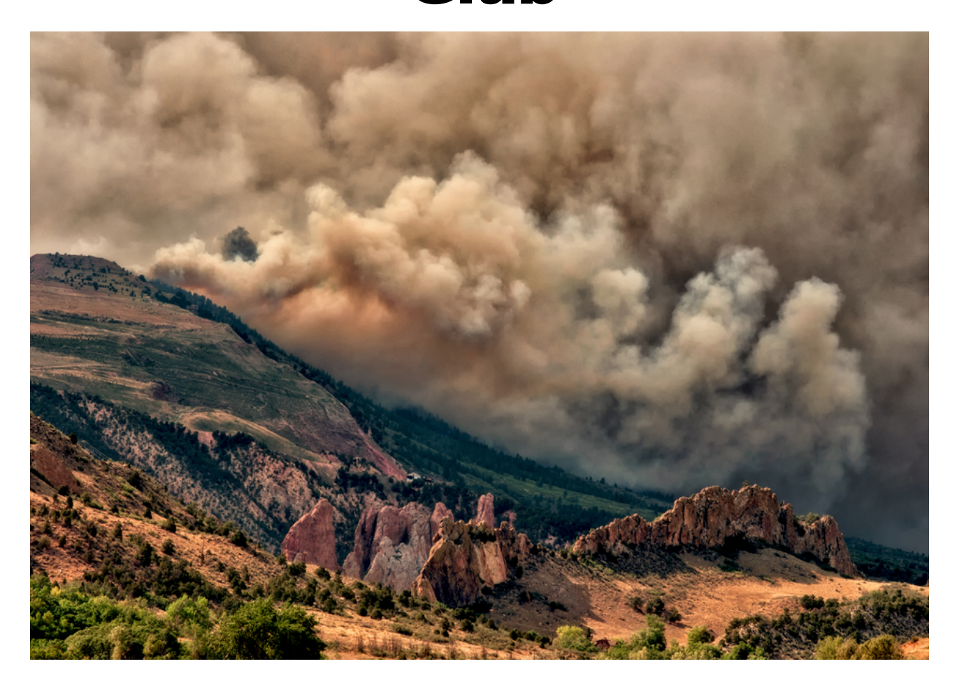
"Queen's Canyon June 26,2012" by Debi Boucher