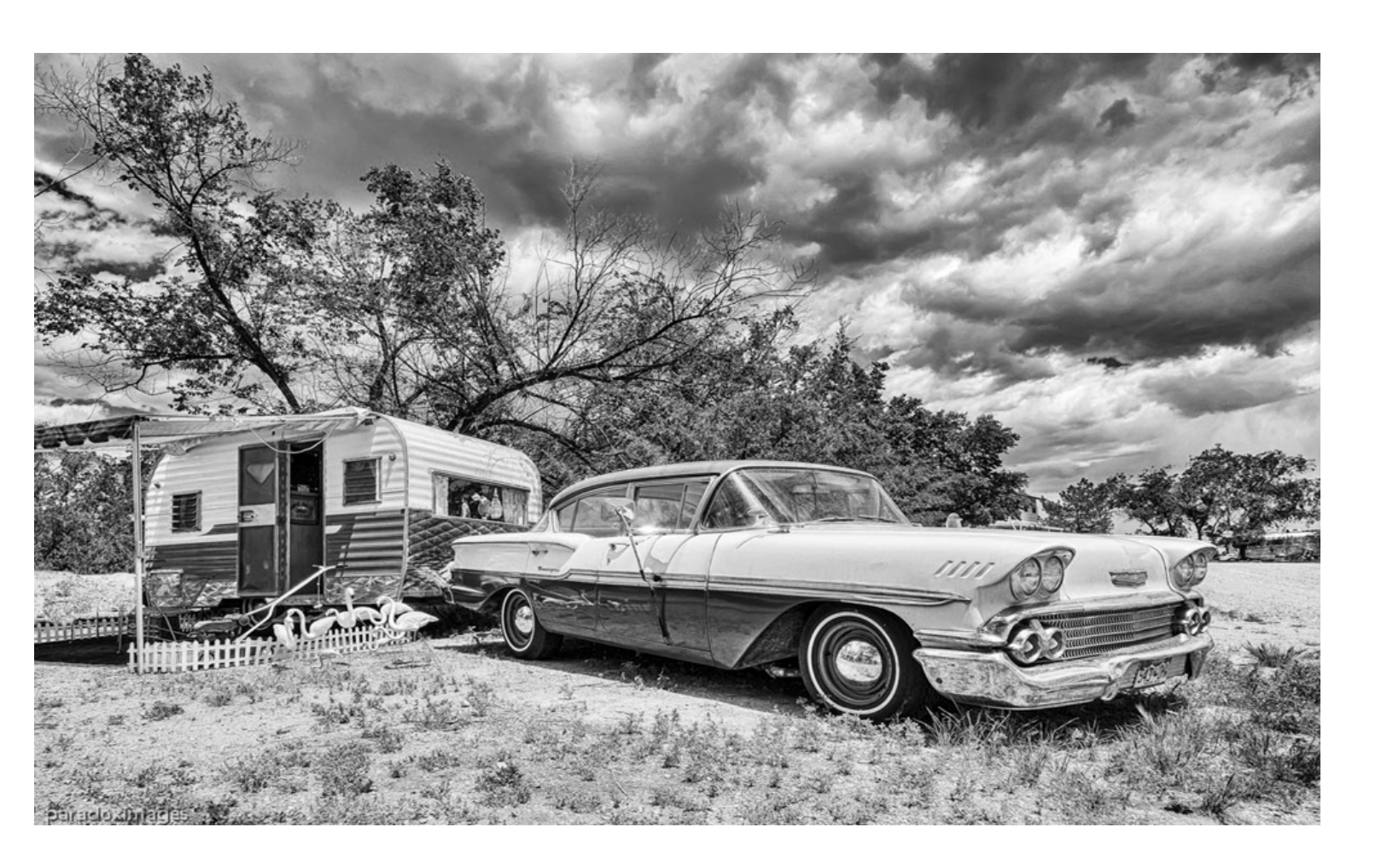
"Some Things Don't Change" by Walter Chambosse

For beginners, these assignments are great for learning to see. For more experienced photographers, these are great ways to stay fresh, to restart the creative eye when you're feeling blocked, or to just do something different. What other self assignments have you tried to refresh your photographic vision?