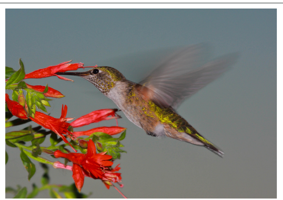
"Hummingbird" by TW Woodruff