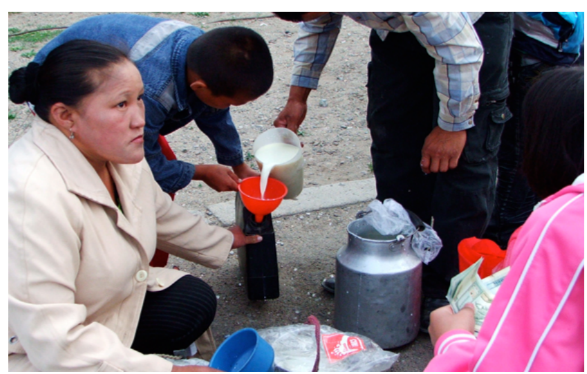
"Selling Yogurt - Mongolia"

"This sure is a long light"